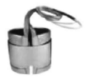
Used mostly with nozzle heaters