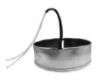
180° from gap